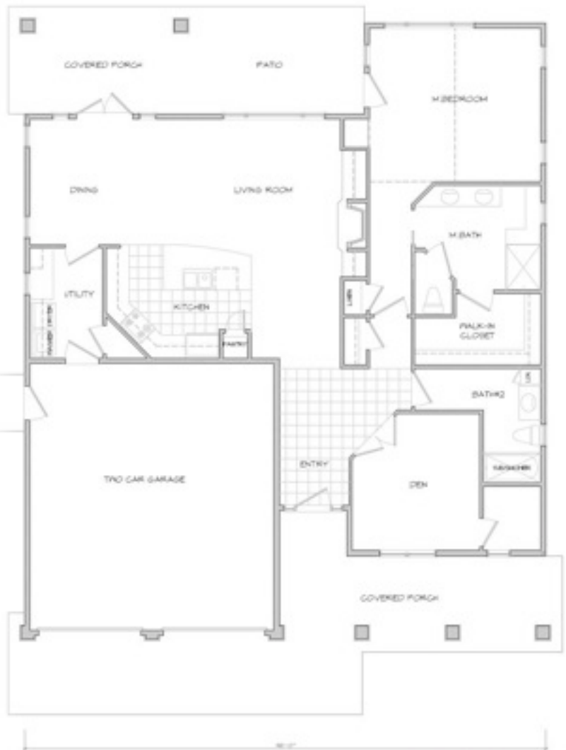
HAWTHORN 26 HIGHLIGHTS: 2 CAR GARAGE, 2 BATHS, 2011 ENERGY STAR APPLIANCES

The Energy Star label is awarded to homes that have been independently verified to be up to 30% more efficient than state energy codes. These savings are based on heating, cooling, hot water use, and are typically achieved through a combination of tight duct systems, upgraded heating and air conditioning systems, Energy Star qualified windows, increased insulation, and high-efficiency water heating equipment.